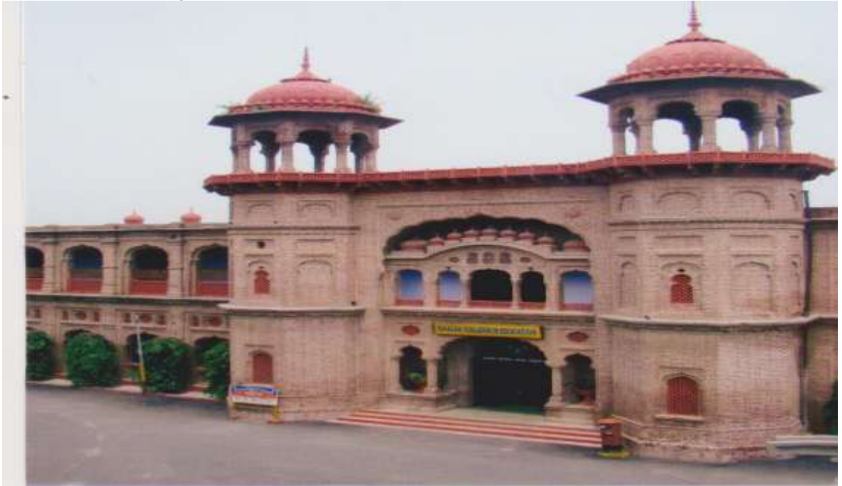
Historic College Building Est. – 1892

Submitted By: Khalsa College of Education, G.T. Road, Amritsar – 143 002