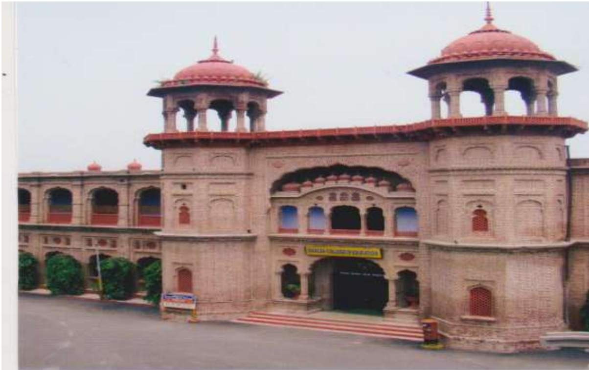
Historic College Building Est. – 1892

Submitted By: Khalsa College of Education, G.T. Road, Amritsar – 143 002